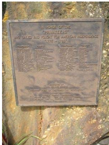
By Bill Coughlin, August 28, 2008